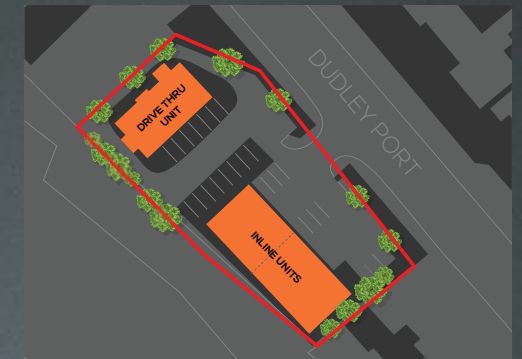
Indicative layout. Not to scale.

Planning consent will be obtained for the proposed scheme once pre-lets have been achieved.