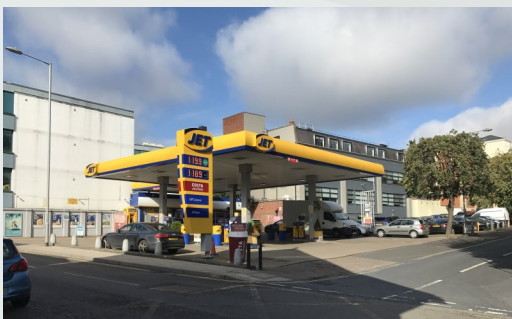
Norwich Valuation for secured lending purposes