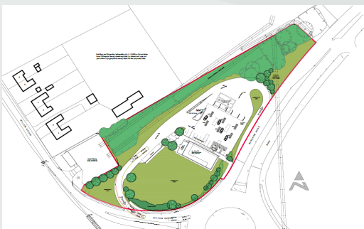
South Woodham Ferrers Achieved planning consent and let petrol station