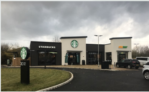
Brampton Hut A14 Lettings at roadside service area

Rapleys' Automotive & Roadside team have been very active in East Anglia with support from services from within the recently opened Cambridge office. Below are some examples of recent petrol filling station and roadside retail instructions: