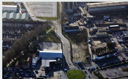
Lowestoft Disposal advice on former petrol station and car dealership advice