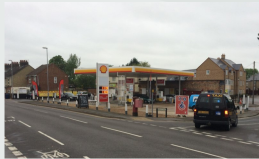
St Neots Sale of operational petrol station