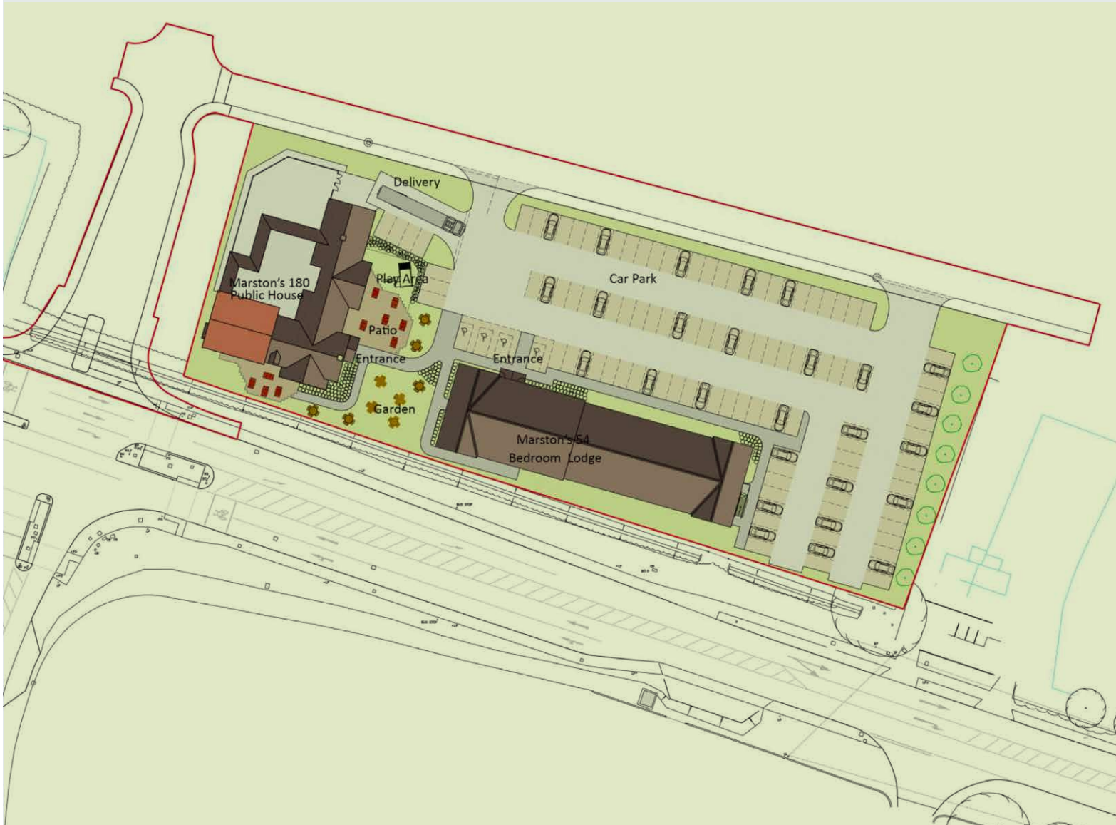
Previously Proposed Development