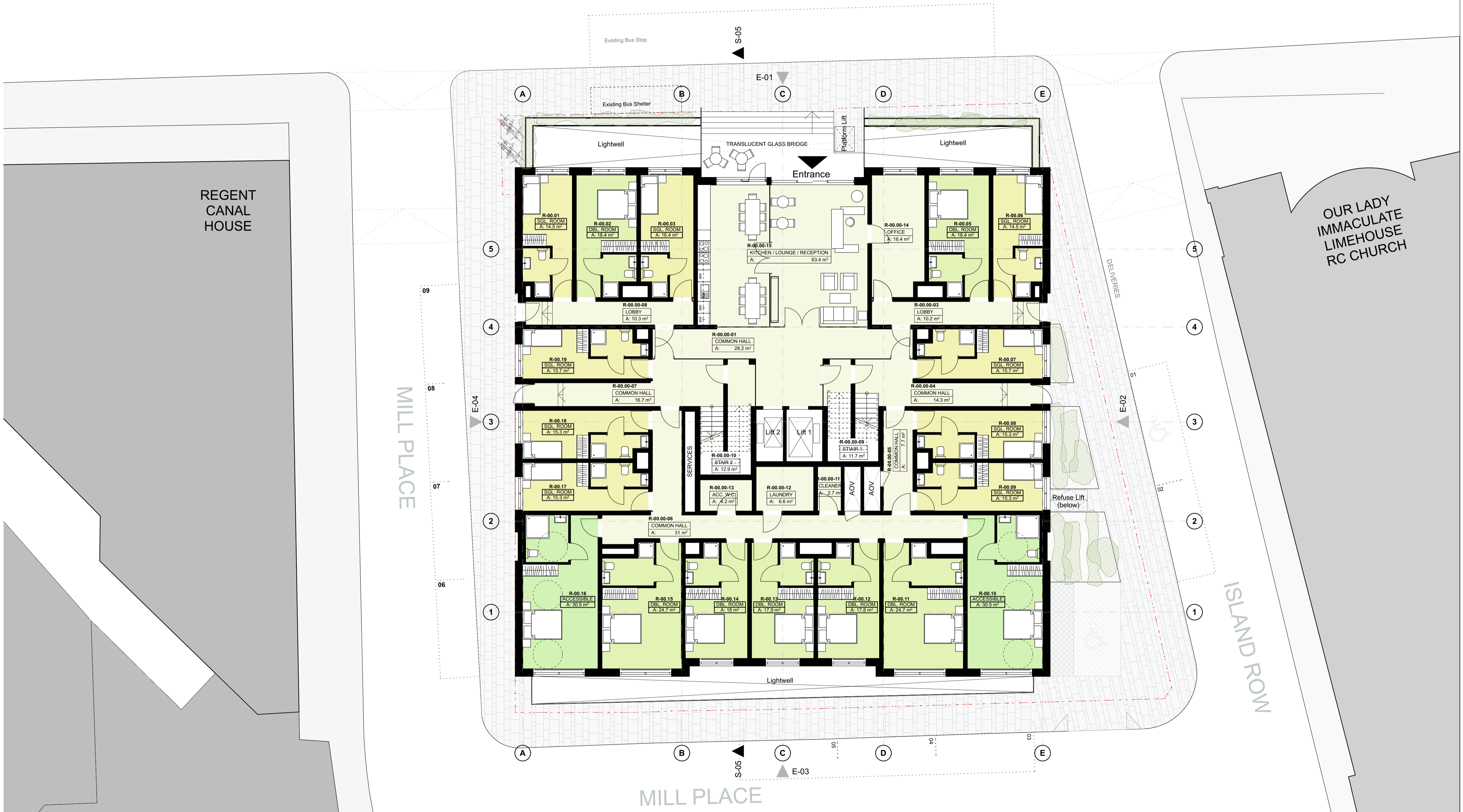
GROUND FLOOR PLAN HOSTEL