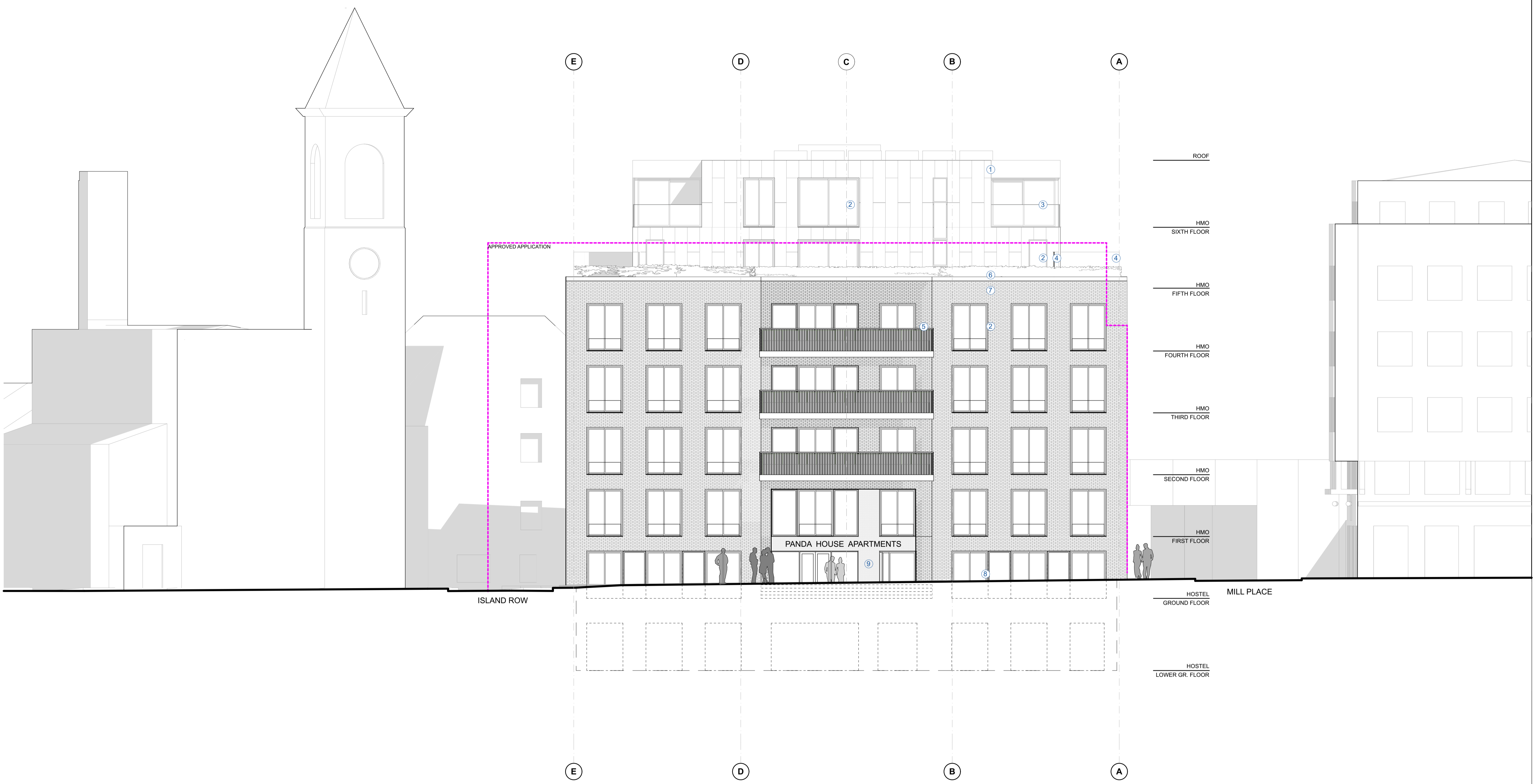
NORTH (COMMERCIAL ROAD) ELEVATION