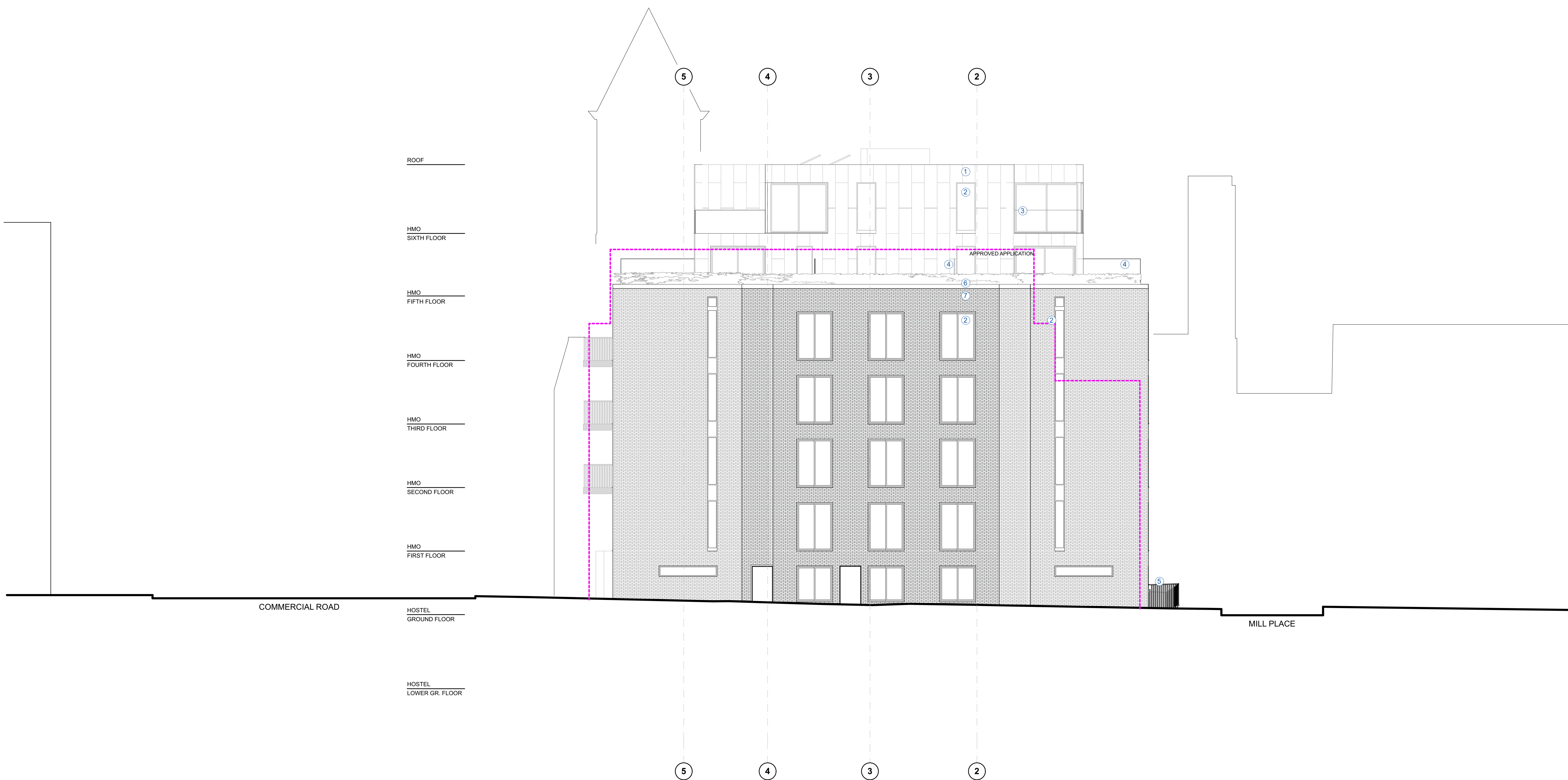
WEST (MILL PLACE) ELEVATION