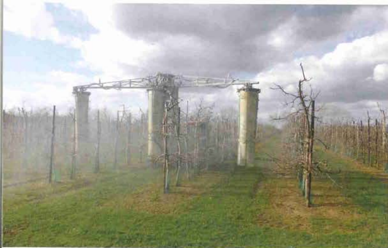
A three-row orchard sprayer in action in a Bramley orchard.