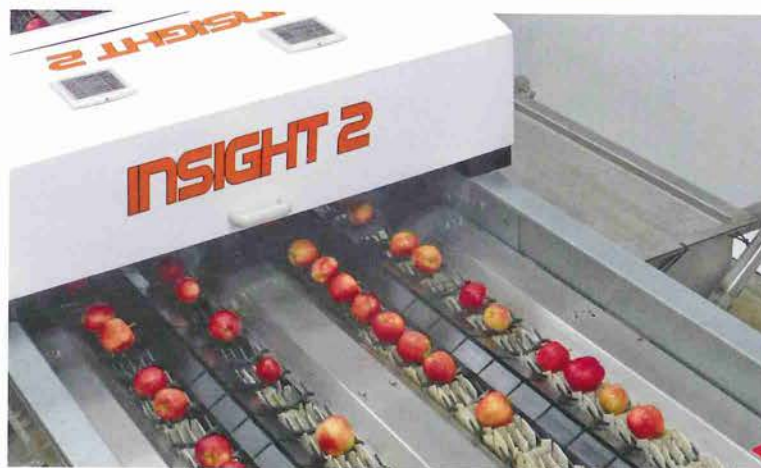
Gala apples entering the pre-sizer's camera module.

Planted at 3.75m x 1.25m in 2006, the Bramley orchard has been root-pruned and the trees mechanically pruned. The mechanical tree pruning is carried out in June and July and involves trimming the