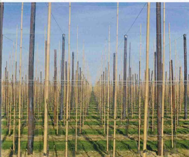
Precision tree support system.

When in place, the net will cover the roof area and down the sides, creating an enclosed environment which, in the Netherlands, has been shown to eliminate the need for insecticide sprays against codling and tortrix moths, when used with