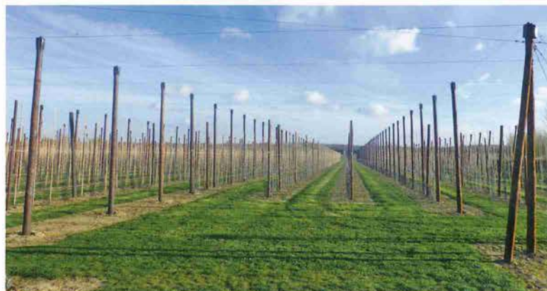
Two central fruit walls flanked by 5m-high hail protection support poles.