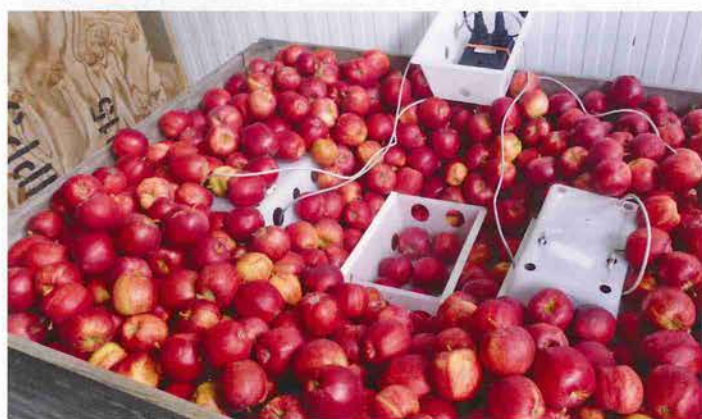
DCA 'kennels' in a Gala bin.

Society members also toured the pre-grading unit and packhouse where Gala was being graded and packed and heard about the expansion of dynamic controlled atmosphere (DCA) storage at Moat Farm.