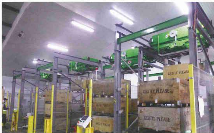
Packing line input robots.

management software. This ensures that bins of the same grade are collected into groups stacked three-high before being transferred to the holding area, while retaining low-volume sizes and/or grades until there are sufficient bins to move away from the pre-sizer.