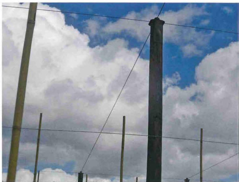
5m-high flat-top hail netting support system.

The structure is of a Dutch design that has been used for five or