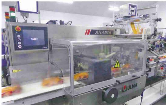
The Atlanta Ulma flow wrapping machine.

From the holding area bins are transferred either to a cold-store or moved to the packing line entry area. Three robots feed the bins into each packing line, while one more deals with the empty bins. The only manual intervention is a forklift truck driver taking the stacks of three bins to the cold-store or to the packing line input robots. Three auto-fed packing lines, comprising two Ulma flow-wrapping machines and one multiline, transfer the fruit to their