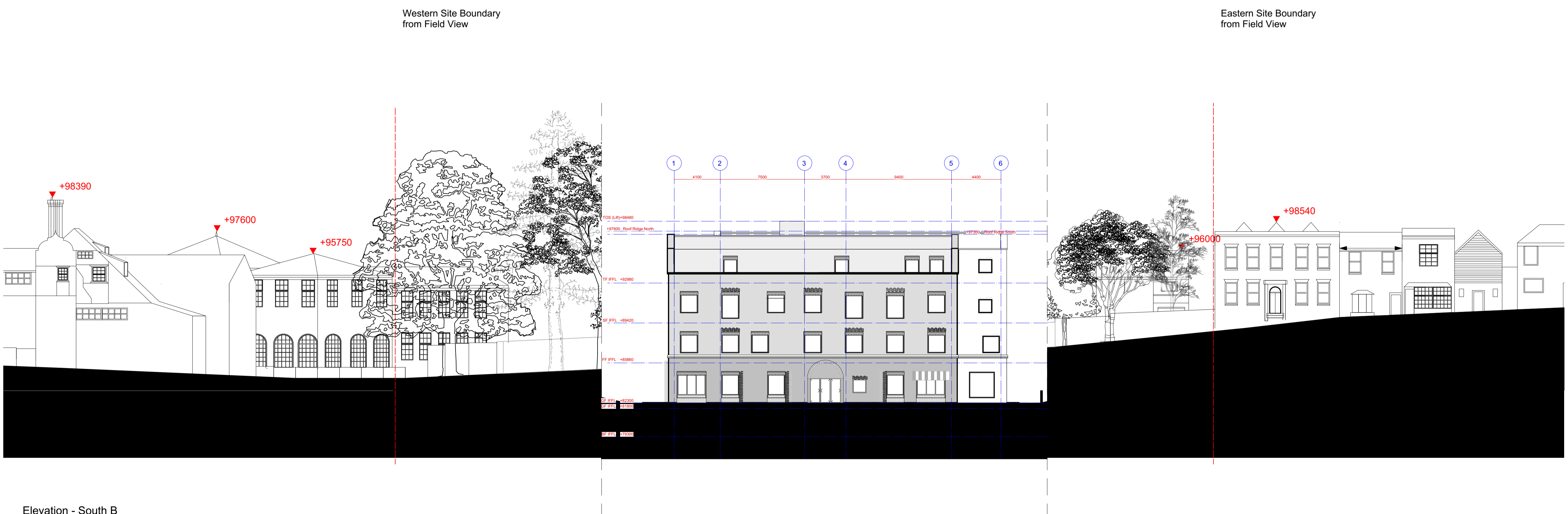
Elevation - South B