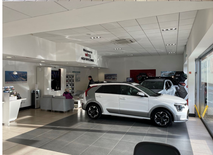
Workshop & Showroom