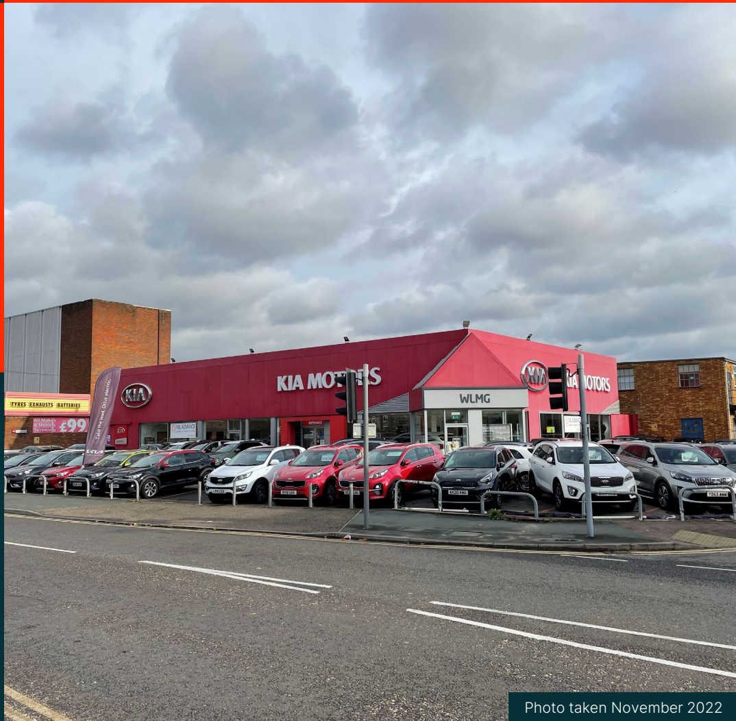
Photo taken November 2022