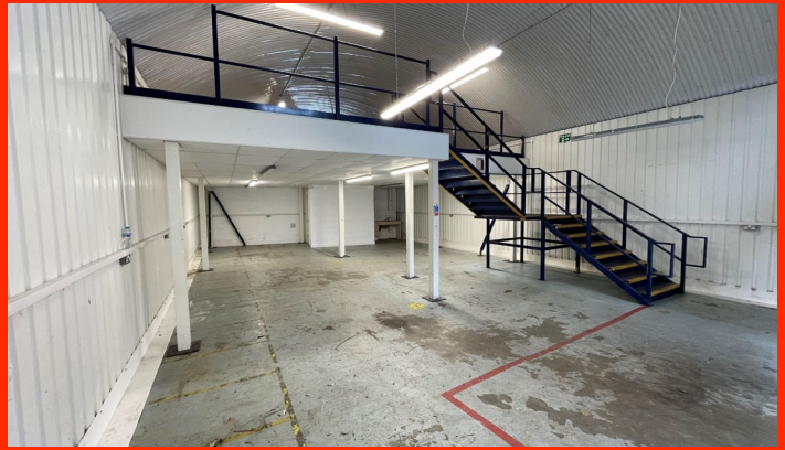
Arch 6 - Internal

Note: The above areas have been calculated in accordance with the RICS Code of Measuring Practice on an approximate gross internal basis and must be verified by interested parties. Unless otherwise stated, the site areas/dimensions are scaled from the Promap Mapping System and must be verified by interested parties.