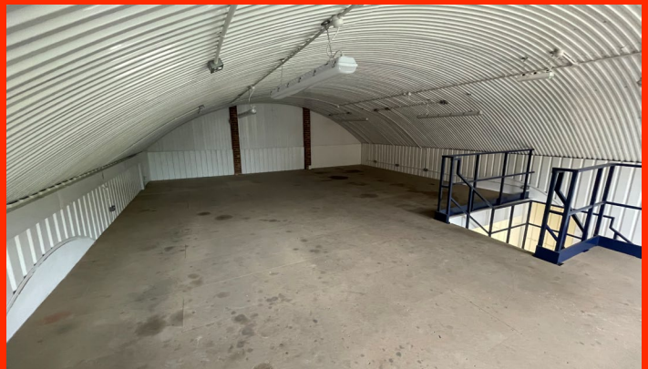
Arch 9 - Internal