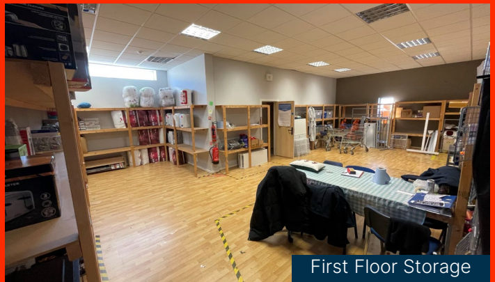
First Floor Storage