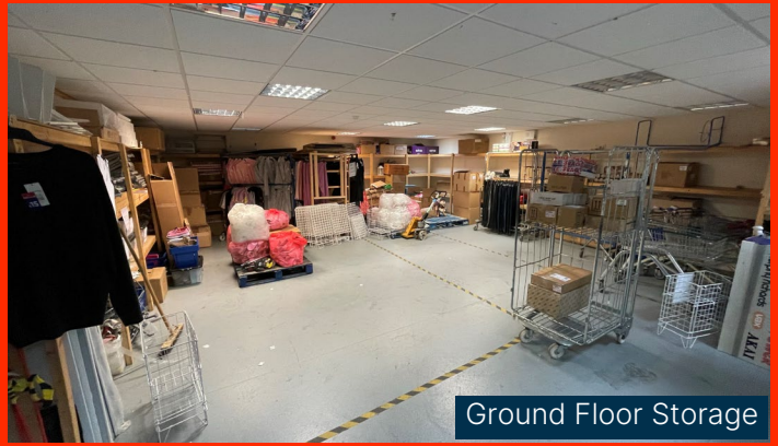
Ground Floor Storage

Note: The above areas have been calculated in accordance with the RICS Code of Measuring Practice on an approximate gross internal basis and must be verified by interested parties. Unless otherwise stated, the site areas/dimensions are scaled from the Promap Mapping System and must be verified by interested parties.