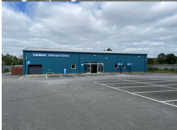
Former Car Store