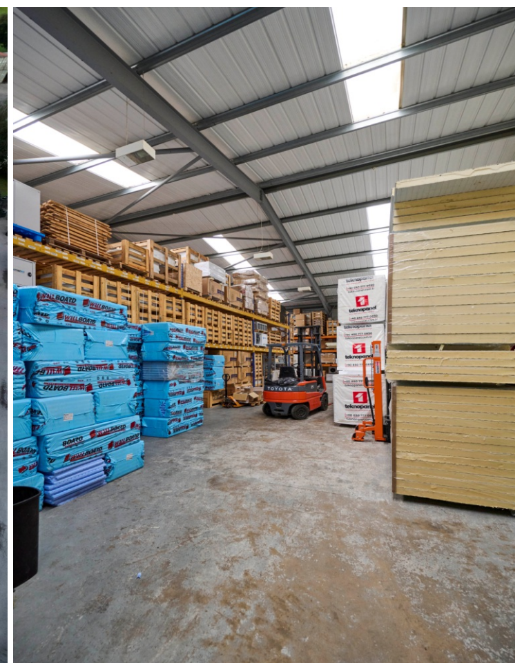
BINDER INDUSTRIAL PARK - DONCASTER