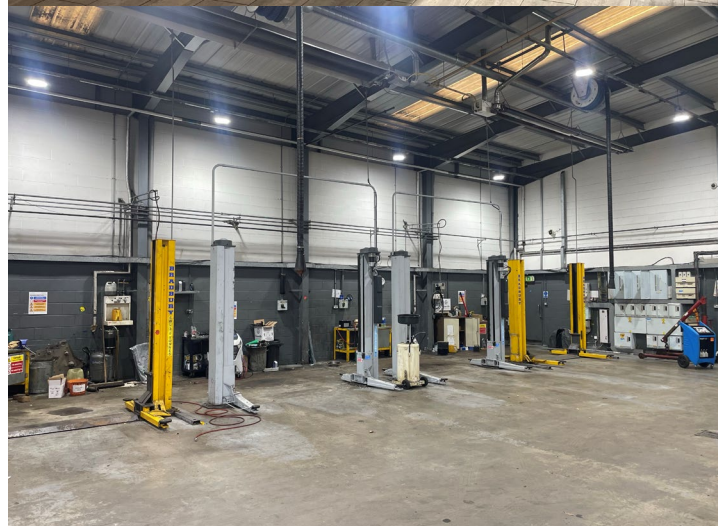
Showroom & Workshop